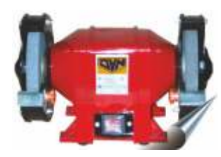
DYN 175 (62-05-000007)