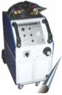
ELEKTRA BECKUM MIG 260 (300)/60 ET, 380V, μ SB 25/3 (94-01-000008)