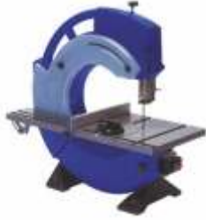
ELEKTRA BECKUM BAS 380, 220V, 740W (94-13-000337)