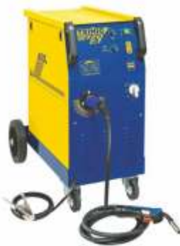
GYS MIG MAG TRIMIG 170-4, 380V, μ μ (66-01-017597)