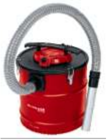
EINHELL 500W, 18L (75-20-000098)