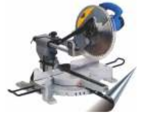
DYN KGS 315 2000W, μ (62-05-000151)