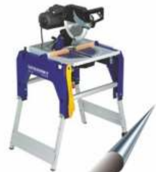
ELEKTRA BECKUM KGT-501, μ (94-13-000505)