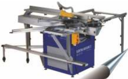
ELEKTRA BECKUM PKF 255, V8, , 380V ( ) (94-13-000412)