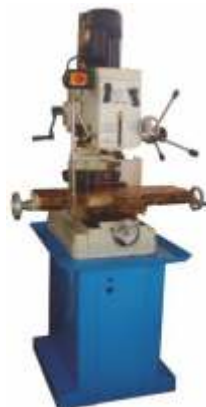
ZX-40 1.5HP, μ, 6 (62-05-000094)