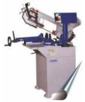
μ CY-210 6.1/2", 3/4HP, 220V, 1 (62-05-000099)