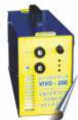
INVERTER VIVO DC 200 (61-01-000062)