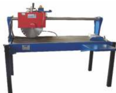
DYN 1,2μ., 350x25,4 ., 2200W (62-12-023120)