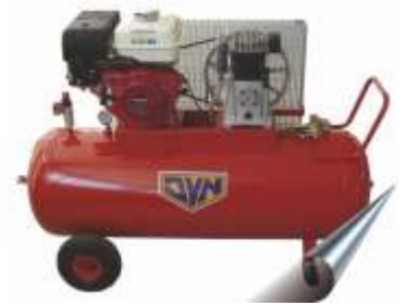
μ DYN 200L/HONDA, 5,3KW (61-01-000337)