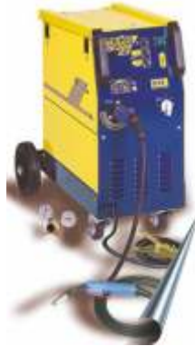
GYS MIG MAG TRIMIG 205/4, 380V, μ μ (66-01-017634)