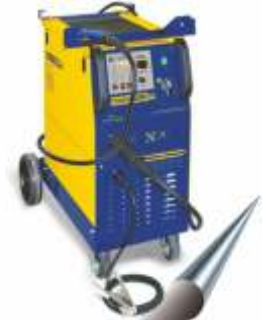
GYS MIG MAG TRIMIG 205.4S, 380V (66-01-019904)