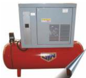
μ DYN μ 270L/3KW, 3 (61-01-000338)