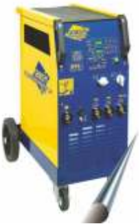
GYS GENEGYS 510 SF, 380V μ (66-01-017832)