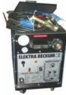
ELEKTRA BECKUM MIG 230(270)/40 ET, 380V, μ SB 25/3 (94-01-000007)