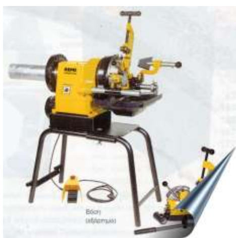
MAGNUM 4000L-T 1/2-4" REMS (69-18-000002)