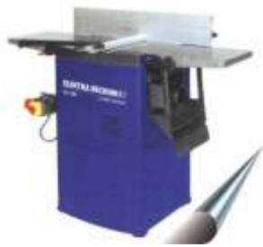
ELEKTRA BECKUM HC 300W (94-13-000334)