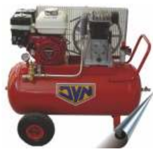
μ DYN 100L/HONDA, 3,6KW (61-01-000336)