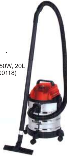
EINHELL 1250W, 20L (75-20-000118)