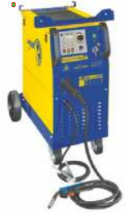
GYS MIG MAG MONOMIG 200-2CS, 220V (66-01-020351)