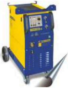
GYS MIG MAG TRIMIG 385/4S, 380V (66-01-033450)