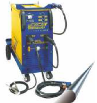
GYS MIG MAG DUOMIG AUTO, 380V μ μ (66-01-017979)