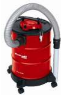
EINHELL 700W, 25L μ (75-20-000072)