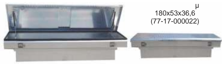
μ 180x53x36,6 (77-17-000022)