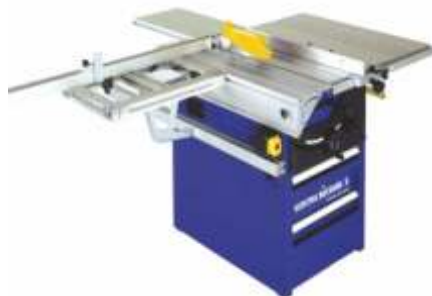
ELEKTRA BECKUM PKU 250 (94-13-000335)