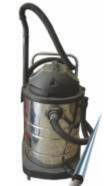
DYN 60L 1400W, 230V / 50Hz (62-05-000350)