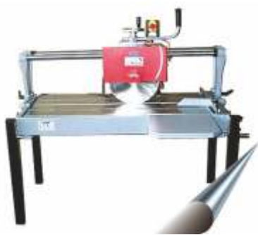
DYN 1μ., 350x25,4 ., 2200W (62-12-000085)