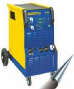
GYS GENEGYS 515W SF, 380V μ (66-01-017924)