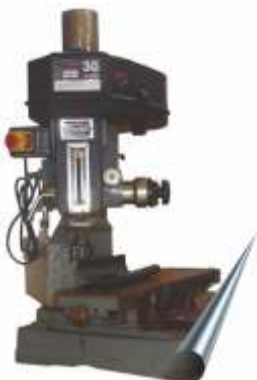
MD-31B/ZX 30, 220V, 1.1/2HP, 12 (62-05-000130)