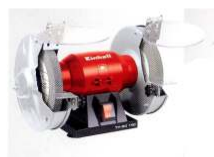
μ 150 EINHEL (75-20-000358)