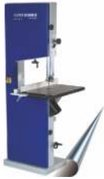
ELEKTRA BECKUM BAS 505G, WNB 230/1/50 (94-13-000516)