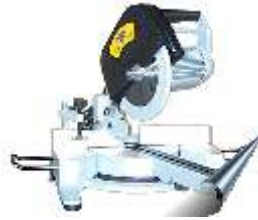
DYN 1600W, 255 μ (62-05-000288)