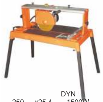
DYN 620 . 250 .x25,4 ., 1500W (62-12-000250)